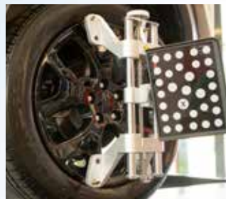
AC200 Clamps (EAK0350J80A)