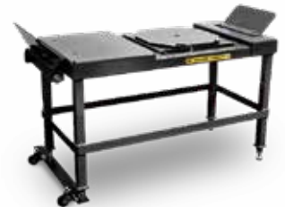
Alignment Stand (RB24)